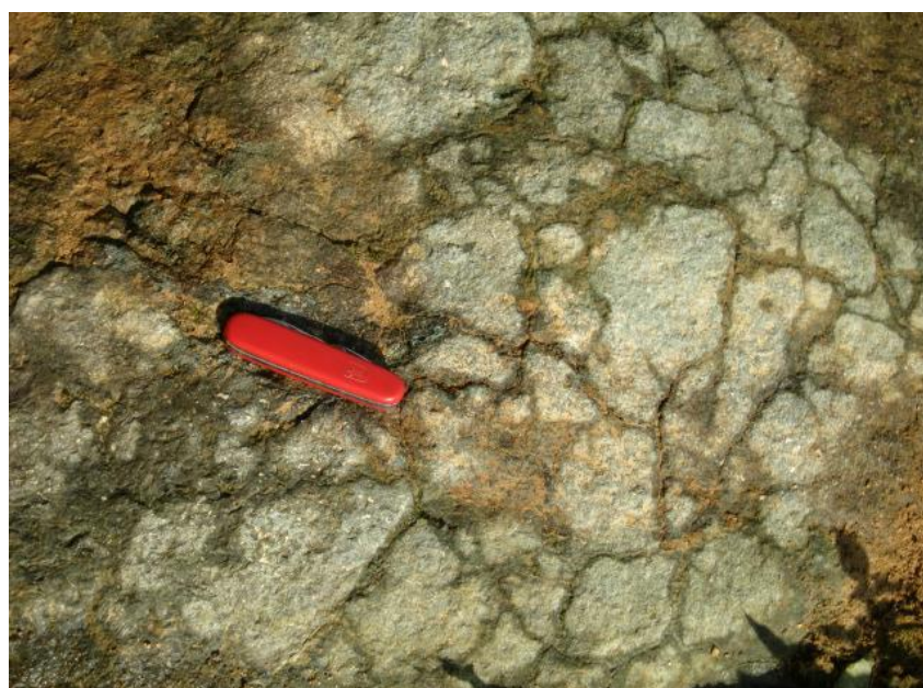
Fig. 1. Fragment of Precambrian Relics in Vakijvari Pluton.

During the research carried out in the Adjara-Trialeti folded zone an important geological data have been obtained. In particular, during the dating process of the zircons by U-Pb method, we found the out that the Vakijvari pluton is composed of the Precambrian, namely Neoproterozoic relics. These relics outcrop fragmentally to 30 m distance and are represented by oval blocks of diameter 0.7 – 1.5 m, which are also crushed into small parts (Fig. 1).