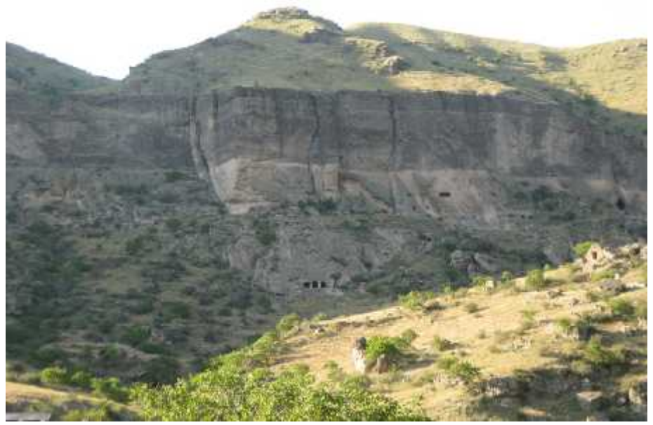
Figure. 3. Microblocks in SW part of Vardzia Area: light color fine-grained andesitic-dacitic welded tuffs.

No less important a role plays the destructive processes of Vardzia complex tectonic structure. The 900 m long tectonic block of Vardzia, which is detached from the main rocks and is gradually subsiding towards the Mtkvari gorge, is split into several microblocks (Fig. 3), therefor its stability is reduced even further. Also strong erosion processes taking place along the Mtkvari gorge, cause significant destruction processes.