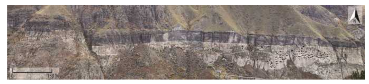
Fig. 1. Panoramic view of the Vardzia region. In white color – volcanic flow of andesitic-dacitic composition. At the top of the flow–an upper part of the Goderdzi suit. In right – the Vardzia cave city.