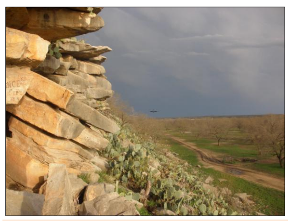
Figure 10: The 'horizon notch'. It was not until the photographs were reviewed following the first survey trip that this photograph produced one of those 'ah ha' moments with the realization that the cliff intersected the far horizon, created a significant horizon feature or 'notch' that could be used to measure the travel of the Sun along the horizon (photograph: Gordon L. Houston).

ures, due to the lack of any topographical relief.