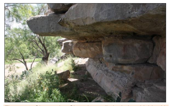
Figure 11: Observation Site 1 has a limited viewshield, with the horizon notch blocked from view. Other negative features include a limited living area, a low ceiling, and the roof and weather protection was poor.

Figure 9 shows the first indication of a horizon feature that could be used to measure the Sun's travel. This dip is created by the bluff visually meeting the distant horizon. Figure 9 was taken from the western end of the main cliff area above the portion containing the pictographs. The entire length of the bluff was surveyed for possible observing positions and/or material evidence of observations. No evidence was found of an observing position along the top of the bluff, which provides no protection from the weather or the Sun. One of us (G.H.) experienced the winter weather during several survey trips, and the Arctic north winds were so cold that even with modern thermal clothing it was difficult to withstand the conditions without taking advantage of the shelter provided by the cliff. Hence, this lack of weather protection was one reason that we eliminated any position on top of the bluff as a place of observation. Ultimately, there were no