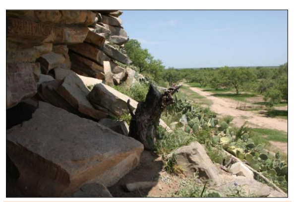
Figure 13: Observation Site 3. This was the final site considered as a Sun-watching location. It had all the qualities that neither of the other potential sites possessed, including a clear view of the horizon and the 'horizon notch'.

The other distinctive feature of Observation Site 3 was the presence of 47 tally marks (Figure 15) on a layer of rock just above the large rock that would have been used to sit on. In fact, there are a number of other sets of tally marks only in this area of the cliff, with some being in black and underneath portions of other tally marks. No one has suggested why these are here, as they are limited to this area and do not have any design similarities to the pictographs. This material evidence is surely the key to the horizon astronomy. Marshack (1985) discusses record keeping, and Murray (1986) describes tally marks at Northern Mexico rock art sites. If you count 47 days from 6 November (the midway point between the autumnal equinox and the winter solstice), the date when the Sun is at the 'horizon notch', you arrive at the day of the winter solstice. If you counted backwards from this date, identification of the equinox would also be possible. This indicates that Observation Site 3 was a primary Sun-watching location.