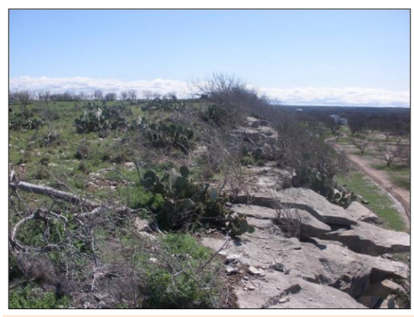
Figure 9: A photograph taken from the western end of the upper bluff area, looking east. Where the cliff meets the far eastern horizon, a 'horizon notch' occurs (photograph: Gordon L. Houston).

ern horizon) and Figure 8 (the western horizon), where both horizons are straight and almost featureless. A field survey of these two horizons from the upper bluff area confirmed that it was impossible to measure the movement of the Sun along the horizon, using horizon feat-