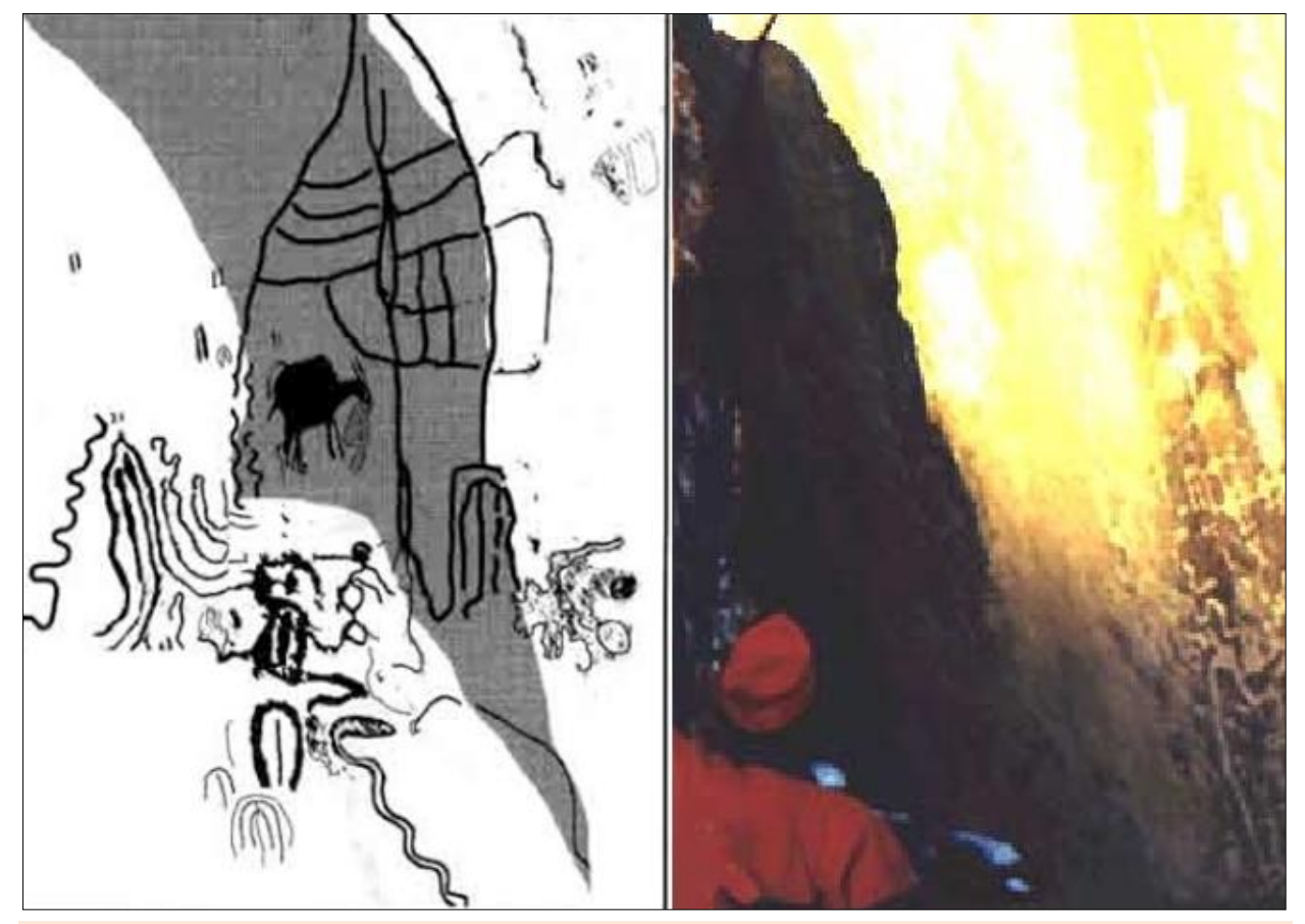
Figure 17: The sketch and picture shows a geometric alignment (3.1) on the equinox morning sunrise. The right edge of the shadow mimics the outline of the glyphs. The alignment is precise, except at the upper and lower portions, which is possibly explained by changes in the edge of the shadow casting rock (adapted from Lehrburger, 2005: 13–14. Photograph and sketch by Carl Lehrburger).

As the Sun moves along the ecliptic, its altitude changes throughout the year. Thus, the Sun's rays hit the Earth's surface at different angles virtually every day of the year. These geometric configurations, the angle of the Sun's rays and the angular position of rock surfaces and gnomons, are unique to each rock art site. Thus, these geometric conditions create unique 'Geometric Alignments' (3.1) with the rock art. There are two types of Geometric Alignments. One is formed by a Sun or shadow line, usually straight in nature, which moves across a panel