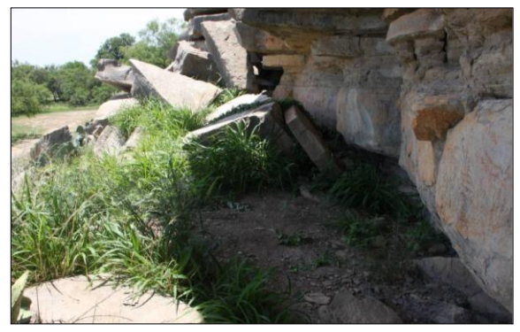
Figure 12: Observation Site 2. This was the first area selected. It has an extended living area, but the viewshield did not include the 'horizon notch' or that portion of the horizon traversed by the Sun.

When Observation Site 1 (Figure 11) was examined it was found to possess one major flaw: the horizon and the notch were not visible. An obstructed view also was true for Observation Site 2 (Figure 12). Both of these locations had additional negative qualities. Observation Site 1 had limited living space, a low ceiling, and the roof slabs did not provide protection in wet weather. Observation Site 2 had a larger potential living area, but the overhead rock layers were broken and would not provide good weather protection. Observation Site 3 (Figure 13) had all the right qualities: a good view of the horizon and the 'horizon notch', a large living area, and a large rock for seating purposes. It also had a solid roof, which provided excellent protection from Sun, wind and rain (see Figure 14).