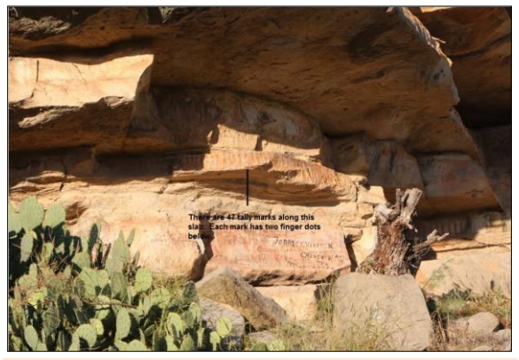
Figure 15: Observation Site 3 has a slab with 47 tally marks. Each tally mark has two small marks below, suggesting their use in multiple counting sequences. No marks of this nature exist at the other two sites.

A horizon survey of Observation Site 3 was then carried out. Figure 16 is a sketch of the horizon, with significant points of interest marked, and calibrated with calculated declination points. The 'notch' created by the intersection of the cliff and the horizon has a calculated declination of -16^{\circ} 03' 47.9", which closely matches the Sun's declination on 6 November. The calculated declination tallies with that provided by the MICA program (see U.S. Naval ..., 2005) of -16^{\circ} 16' 12.0", Aveni's (2001) Solar Declination