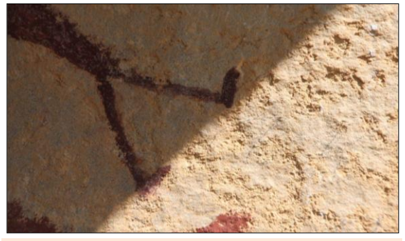
Figure 5: The equinox panel solar interaction taken the day after the equinox on 23 September 2013, at 15:34:33 CST, 20:34:33 UTC. Although taken about 2 minutes prior to the time of the photograph taken on the day of the equinox, the sun line is already up on the ankle of the lower foot (photograph: Gordon L. Houston).