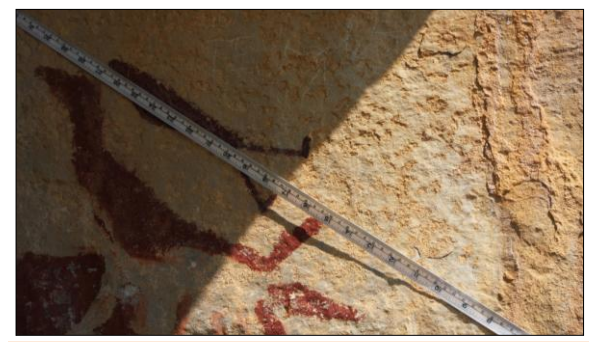
Figure 3: The equinox panel at Paint Rock. This photo was taken on the day of the autumnal equinox, 22 September 2012 at 15:39:04 pm CST/ 20:39:04 UTC. The sun line advances across the pictograph on the equinoxes, aligning with the feet of the funeral figure on the upper right, making it appear to be walking up the line. On the day before and after, the sun line does not touch both feet at the same time: see Figures 4 and 5.