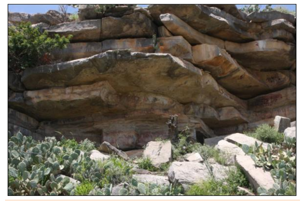
Figure 14: Observation Site 3 has a continuous, unbroken rock slab layer, providing excellent weather and rain protection.

A horizon survey of Observation Site 3 was then carried out. Figure 16 is a sketch of the horizon, with significant points of interest marked, and calibrated with calculated declination points. The 'notch' created by the intersection of the cliff and the horizon has a calculated declination of -16^{\circ} 03' 47.9", which closely matches the Sun's declination on 6 November. The calculated declination tallies with that provided by the MICA program (see U.S. Naval ..., 2005) of -16^{\circ} 16' 12.0", Aveni's (2001) Solar Declination