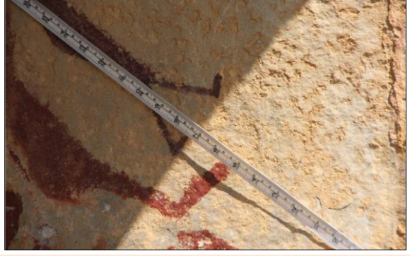
Figure 4: This equinox panel photo was taken 21 September 2012 at 15:38:16 CST, 20:38:16 UTC, the day before the equinox. The sun line has reached the rear foot but is clearly away from the upper heal of the figure; see Figure 5, taken the day after the equinox for comparison.